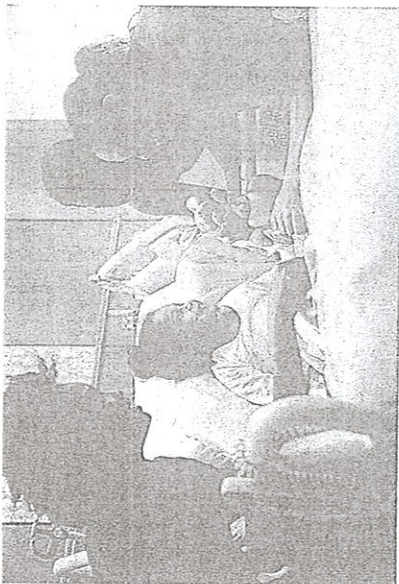
Figure 4.1. A children's ward

The staff working in health services have the responsibility and obligation to provide an environment in which patients feel secure and safe enough to regain their health as soon as possible.