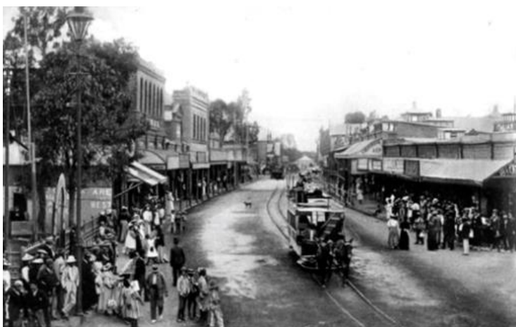
Du Toit's Pan Road, Kimberley, 1899